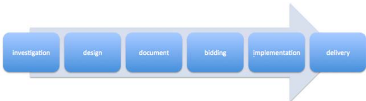
Figure2: The project bidding process.

Taking the opportunity to construct a training base for fostering the professional application-oriented talents for the Ningbo IT industry, the College has embarked on a reform of the graduation internship as the integration point to boost undergraduates' professional ability. From 2011, well-known domestic and foreign companies have been used to innovate the campus graduation internship and training based on the virtual enterprise. In this way, the student's professional abilities including their career planning, professional skills and qualities, etc., will be enhanced synchronously, as is the student's teamwork awareness and the teamwork spirit, which will be improved as well.